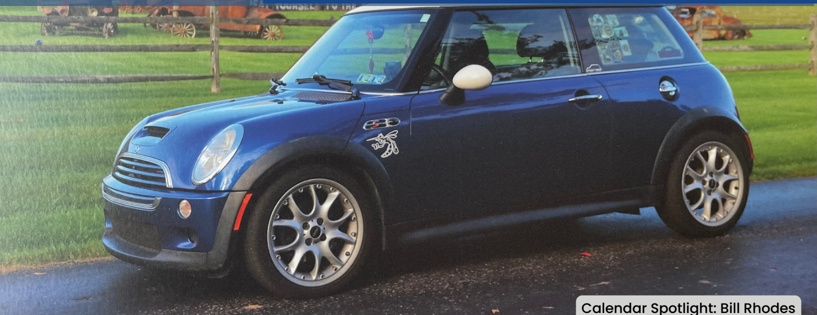
Calendar Spotlight: Bill Rhodes